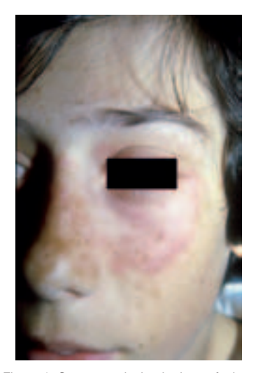
Figure 1. Cutaneous lesion in tineae faciae

Tinea capitis is undoubtedly the most frequent manifestation of T. soudanense in children and young