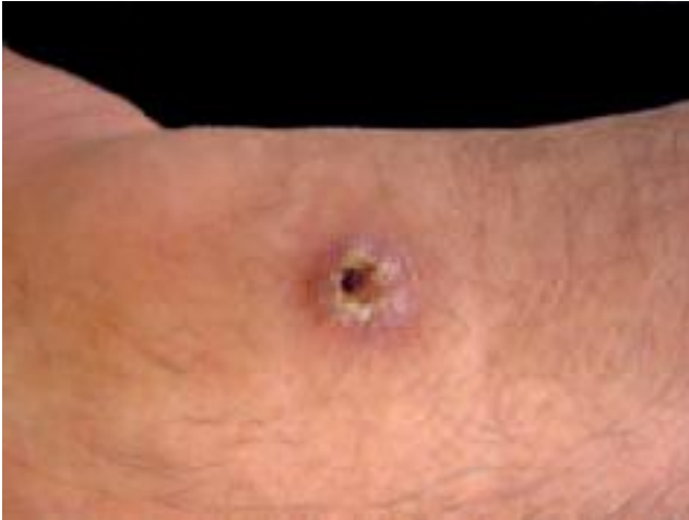
Figure 1. Erythematous nodule on the right forearm.