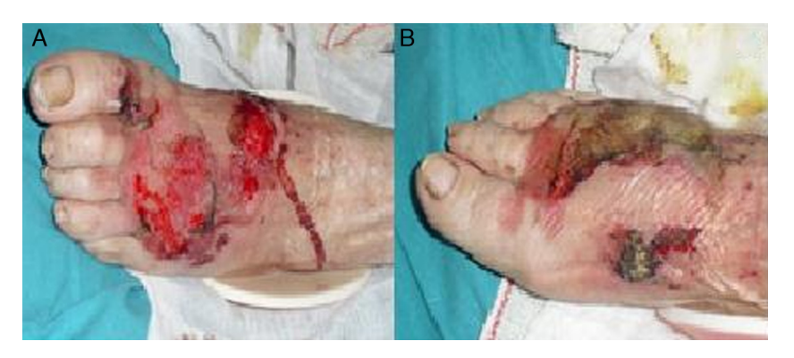
Fig. 1. Photograph of the anterior surface of the left (A) and right (B) feet showing ulcerous lesions.

Based on the difficulty to identify Fusarium at a species level, the isolate was sent to the Medical Mycology laboratory (Faculty of Medicine) where it was subcultured on Potato Dextrose Agar, Corn Meal Agar and Malt Extract Agar. Macroscopic and microscopic features were exhaustively studied and concluded in the identification of the strain as F. dimerum (Fig. 3). For molecular identification, ITS1-ITS4 and the 5.8S region of the rDNA were amplified with specific primers in a semi-nested PCR.<sup>4</sup> The sequence of a