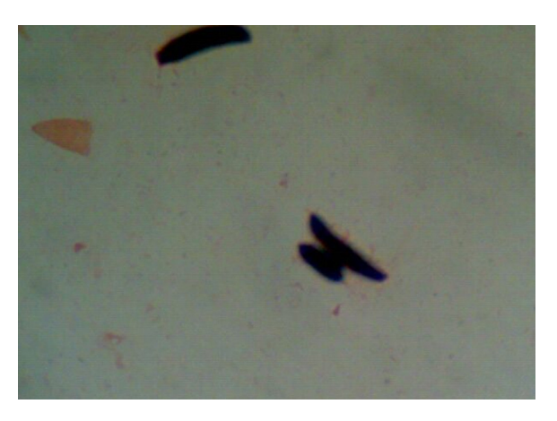
Fig. 2. Direct microscopic observation of the right foot sample. Gram stain ( 1000 \times ).

Physical examination revealed a bad general status and hemodynamic compromise with BP 65/38 mmHg. The cardio-pulmonary examination showed low rhythmic tones and bilateral basal crackles. Laboratory investigations revealed signals of renal failure (creatinine: 8.73 mg/dl; glomerular filtration rate: 5 ml/min), metabolic acidosis (pH: 7.26, HCO<sub>3</sub>: 16.2 mequiv./L), light thrombocytopenia (122 \times 10^3 / \mu L) , leukocytosis (37 \times 10^3 / \mu L) and anemia (Hb: 7.6 mg/dl; VCM: 115.6 fl). Transaminase enzymes and coagulation were normal. After these findings, a subsequent study of bone marrow and peripheral blood resulted in the diagnosis of acute mieloblastic leukemya (AML). Hemodynamic support measures and intravenous treatment with antibiotic were established considering the renal function. Piperaziline-tazobactam 2 g/8 h and levofloxacin 250 mg/48 h were prescribed. Two samples of the curettage of the ulcer lesions were taken and sent to the microbiology laboratory. Both samples were studied under optical microscopy and cultured on sheep blood agar, blood-CNA agar, Polivitex agar, McConkey agar and Sabouraud-Cloramfenicol-Gentamicin agar. After Gram staining,