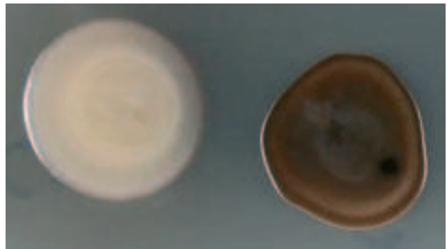
Figure 2. Melanin (JEC 21, right) and non-melanin (JEC 20, left) forming colonies of C. neoformans serotype D on L-DOPA medium after 5 days at 25 °C.

grow optimally at temperatures above 30 °C [86,129] and temperature sensitive mutants of C. neoformans are attenuated in virulence [128]. Another important virulence factor is the production of a large polysaccharide capsule (Fig. 1). Acapsular mutants are avirulent in mouse models [22-25]. Capsule size increases during infection [46] and can be induced in vitro by high CO 2 concentration [59], iron deprivation [163], and serum [178]. Although some properties of the capsule enable the host to clear C. neoformans more effectively, others protect C. neoformans against host defenses. Overall, the effect of the capsule is beneficial: encapsulated cryptococcal cells are not phagocytized or killed by neutrophils, monocytes or macrophages to the same degree as acapsular cells [9]. The production of melanin is another important virulence factor (Fig. 2). Melanin synthesis is catalyzed by a laccase and may occur when phenolic compounds, e.g. catecholamines, are present [127,130,172,173]. Dopamine, a catecholamine which is present in the brain, is a substrate for melanin synthesis [10,172]. The ability of C. neoformans and C. gattii to form melanin has been used to develop